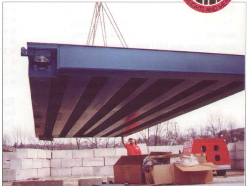
Heavy tubular deck module is lowered into place.

LIFETIME GUARANTEE AGAINST WATER AND LIGHTNING DAMAGE ON ALL HYDROSTATIC LOAD CELLS