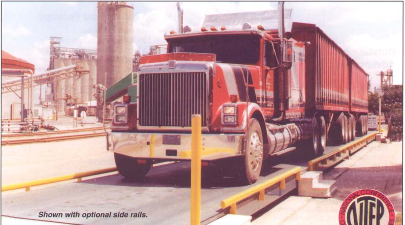
Shown with optional side rails.