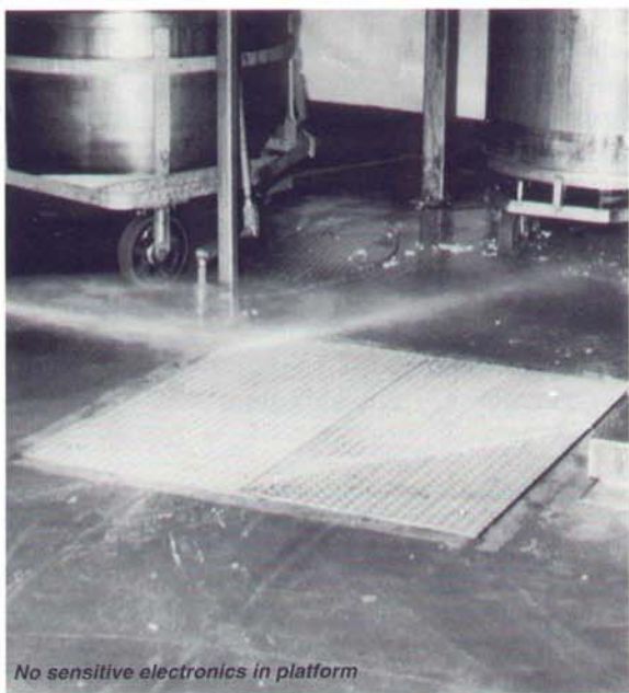
No sensitive electronics in platform